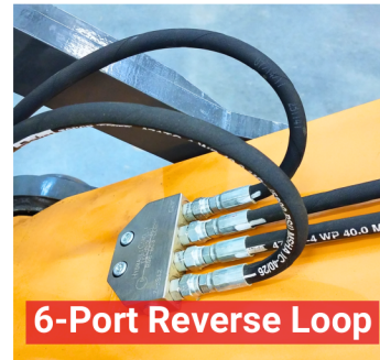
6-Port Reverse Loop